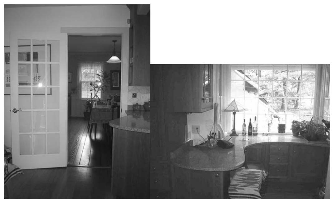
photo: ample natural daylight means reduced energy use and healthier light quality; indoor windows allow light to be "borrowed" from one room to another